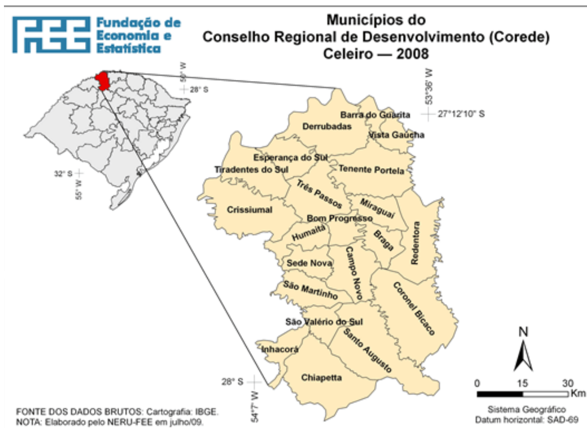
Figure 1 – Location of the study